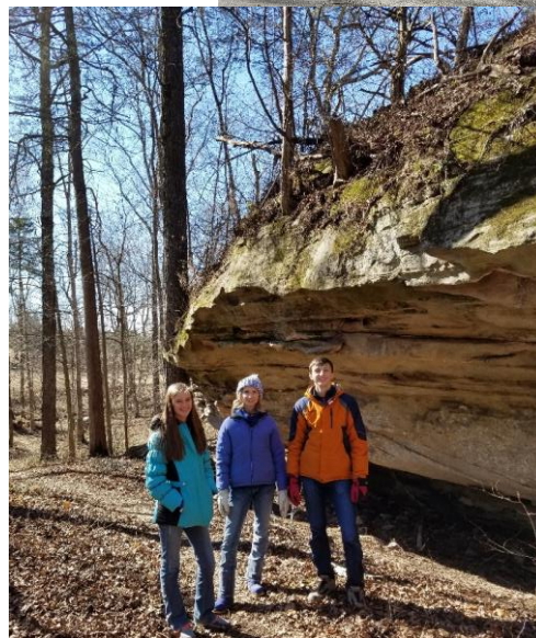
Great Hiking Trails