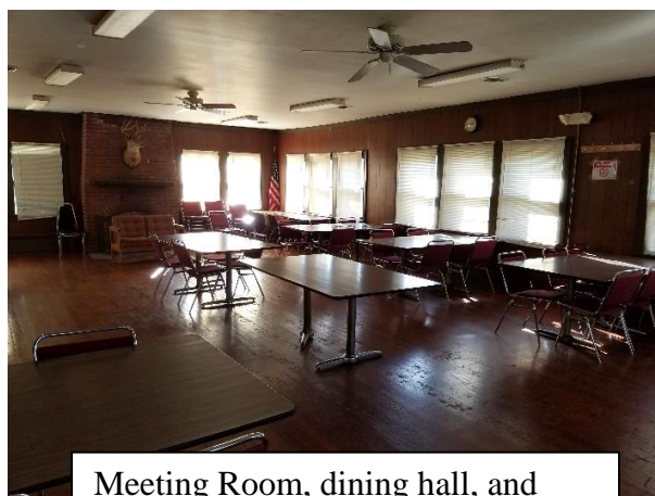
Meeting Room, dining hall, and worship area