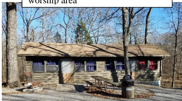
The Cabins are duplexes with 4 bunk beds on each side.