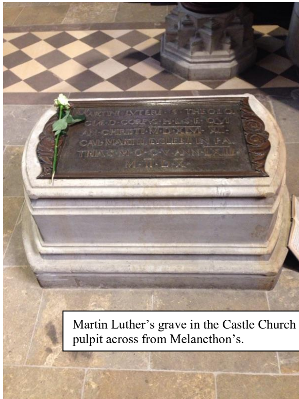
Martin Luther's grave in the Castle Church in Wittenberg is by the pulpit across from Melancthon's.

O Lord Jesus Christ, we give You thanks that through death You have destroyed the power of death and delivered us, who through fear of death are in our lifetime subject to bondage, comfort us with Your precious merit and assist us in our last hour by Your grace; through the same Jesus Christ, our Lord, who lives and reigns with the Father and the Holy Spirit, one God, now and forever. Amen.