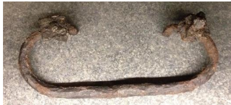
During the course of the reconstruction of the castle church in Wittenberg, two engineering consultants inspect Luther's grave on February 14, 1892 – against an explicit imperial ban from 1885. At a depth of about seven feet they come upon the coffin. Since it is broken in several spots, it is possible to recognize the bones of the Reformer that are in relatively good condition. On this particular occasion the loose coffin handle was recovered and given to the Luther house on May 16, 1913.

Family: “In the third place, from this ordinance of creation God has himself exempted three categories of men, saying in Matthew 19[12], “There are eunuchs who have been so from birth, and there are eunuchs who have been made eunuchs by men, and there are eunuchs who have made themselves eunuchs for the sake of the kingdom of heaven.” Apart from these three groups, let no man presume to be without a spouse. And whoever does not fail within one of these three categories should not consider anything except the estate of marriage. Otherwise it is simply impossible for you to remain righteous. For the Word of God which created you and said, “Be fruitful and multiply,” abides and rules within you; you can by no means ignore it, or you will be bound to commit heinous sins without end.