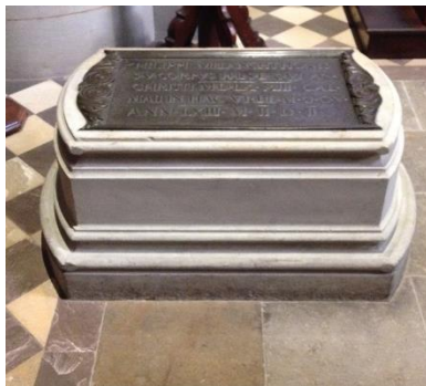
Melancthon's grave in the Castle Church in Lutherstadt Wittenberg.

Almighty God, we implore You graciously to be hold this Your family, for which our Lord Jesus Christ was contented to be betrayed and given up into the hands of wicked men and to suffer death upon the cross; through the same Jesus Christ, Your Son, our Lord, who lives and reigns with the Father and the Holy Spirit, one God, now and forever. Amen.