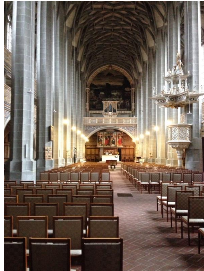
The inside of The Market Church of Our Dear Lady in Halle, Germany. In 1541, Justus Jonas introduced the Reformation into Halle with his Good Friday addresses.

O Lord, we implore You, mercifully hear our prayers, and, having set us free from the bonds of sin, defend us from all evil; through Jesus Christ, Your Son, our Lord, who lives and reigns with the Father and the Holy Spirit, one God, now and forever. Amen.