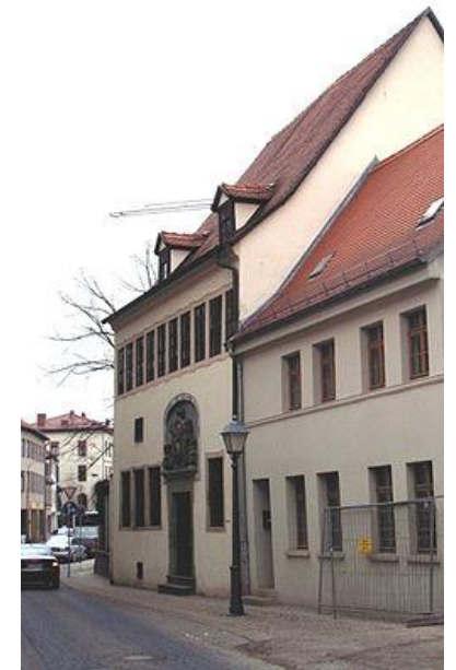
Martin Luther's Birth House is a museum in Eisleben, Germany. The actual house in which Luther was born no longer exists. It was burnt completely to the ground in 1689.

Almighty and everlasting God, the heavenly Father who shows the light of truth to those who are in error so that they may return into the way of righteousness, cause all who are admitted into the fellowship of Christ’s Church to avoid those things that are contrary to their profession and to follow all such things that are agreeable thereto; through the same Jesus Christ, Your Son, our Lord, who lives and reigns with You and the Holy Spirit, one God, now and forever. Amen.