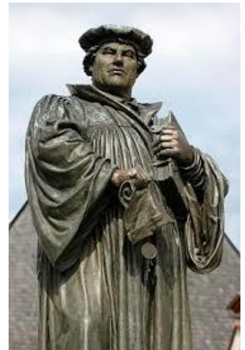
The Luther Statue in Eisleben