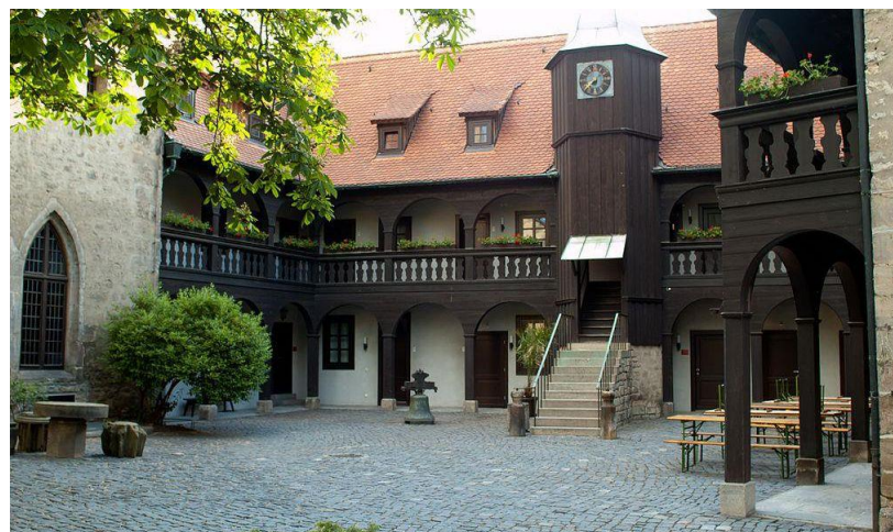
Augustinerkloster, Erfurt (see next page)

O God, the Strength of all those who put their trust in You, mercifully accept our prayers; and because through the weakness of our mortal nature we can do no good thing, grant us the help of Your grace that in keeping Your commandments we may please You both in will and deed; through Jesus Christ, Your Son, our Lord, who lives and reigns with the Father and the Holy Spirit, one God, now and forever. Amen.