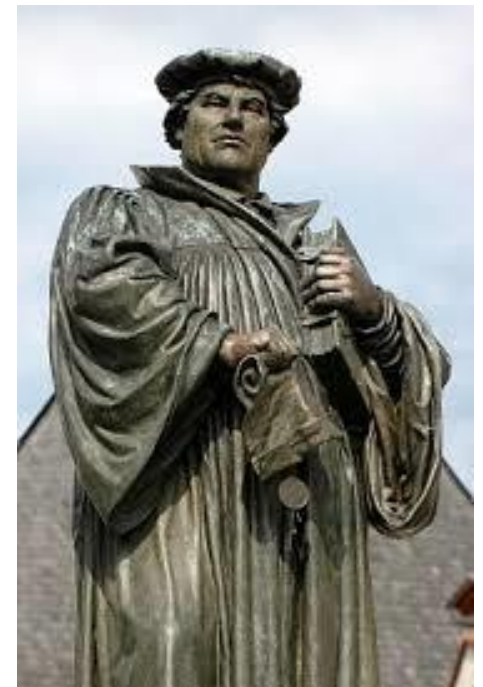
The Luther Statue in Eisleben

Our merciful Father, the God who alone make minds of the faithful to be of one will, cause Your people to love what You command and to desire what You promise, that among the manifold changes of this world our hearts may be fixed where true joys are to be found; through Jesus Christ, Your Son, our Lord, who lives and reigns with You and the Holy Spirit, one God, now and forever. Amen.