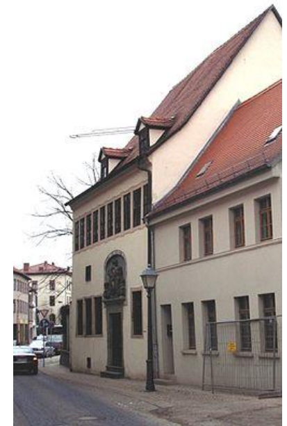
Martin Luther's Birth House is a museum in Eisleben, Germany. The actual house in which Luther was born no longer exists. It was burnt completely to the ground in 1689.

Almighty and everlasting God, the heavenly Father who shows the light of truth to those who are in error so that they may return into the way of righteousness, cause all who are admitted into the fellowship of Christ’s Church to avoid those things that are contrary to their profession and to follow all such things that are agreeable thereto; through the same Jesus Christ, Your Son, our Lord, who lives and reigns with You and the Holy Spirit, one God, now and forever. Amen.