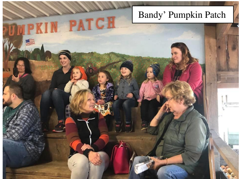
Bandy' Pumpkin Patch