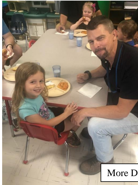
More Donuts with Dad