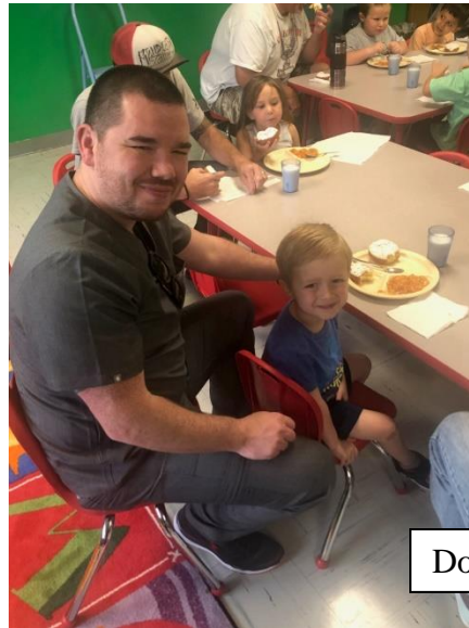
Donuts with Dad

Because of our busy summer schedule Pastor has had to move Chapel on Wednesdays & Thursdays to 8:30 am. We will continue this schedule throughout July as well! The school-age will get instruction by Pastor in the afternoon at 1:00 pm on Wednesday &