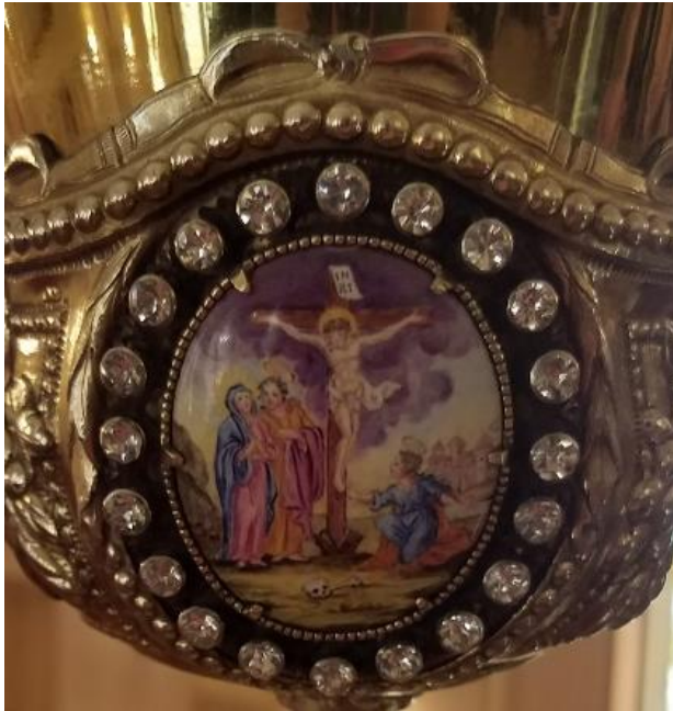
The Crucifixion scene on the cup.