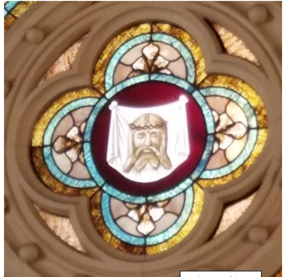
A close-up of the Veronica window