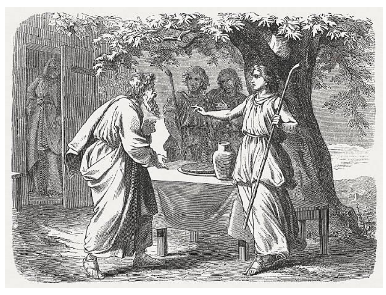
Genesis 18 (NKJV)

1Then the LORD (הְלָּהֹרֶיּ) appeared to him by the terebinth trees of Mamre, as he was sitting in the tent door in the heat of the day. 2So he lifted his eyes and looked, and behold, three men were standing by him; and when he saw them, he ran from the tent door to meet them, and bowed himself to the ground,