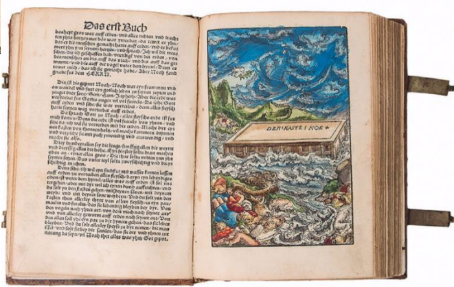
The Flood from Das Alte Testament Deutsch , M. Luther, Wittemberg, 1523. The picture from Luther's 1523 translation (right) was by Lukas Cranach. The picture from Luther's 1524 edition was by Georg Lemberger.

Those who are not yet invited to receive the Sacrament are encouraged to meditate on God's Word in the distribution hymns and pray for the day when our divisions will have ceased.