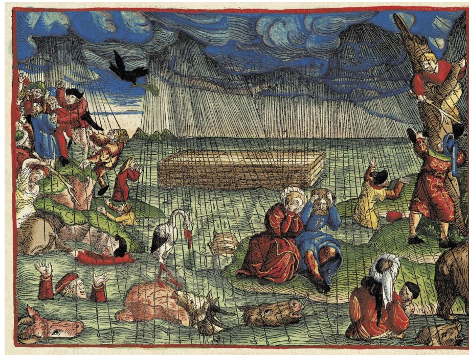
The Luther Bible 1534: Genesis 6 - The Flood, page 24. Biblia, das ist die gantze Heilige Schrift Deusch Mart. Luth... Wittenberg: Hans Lufft, MDXXXIII.

Pecans. —Sometime after October 15th, we will be announcing the beginning of our annual pecan fundraiser for the Learning Center