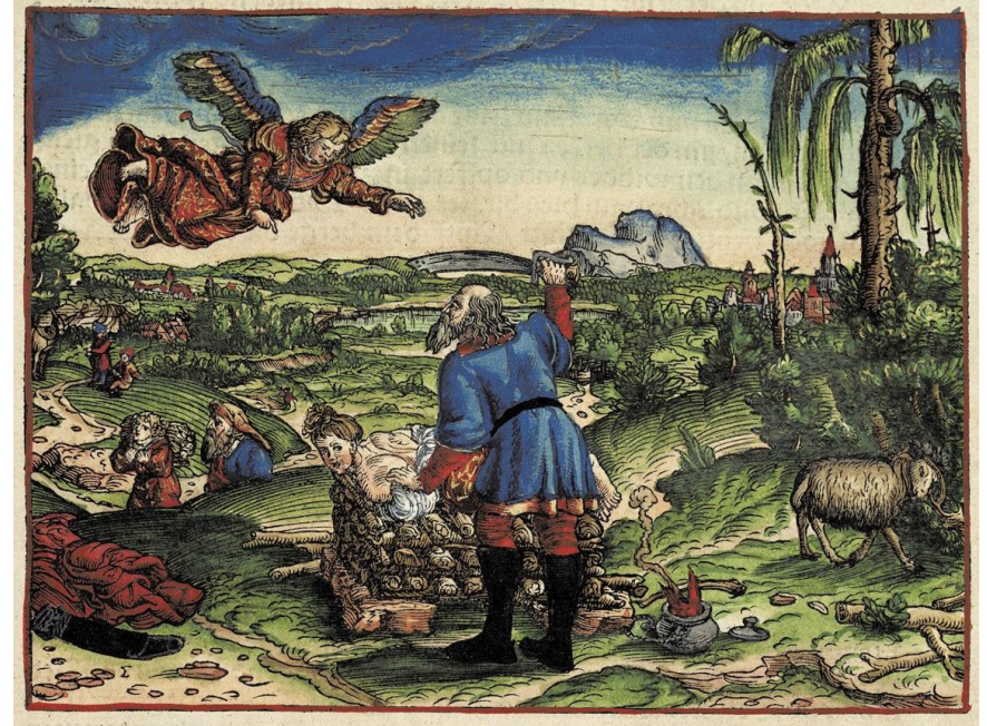
The Luther Bible 1534: Genesis 22 – Sacrifice of Isaac. Page 41. Biblia, das ist die gantze Heilige Schrift Deusch Mart. Luth... Wittenberg: Hans Lufft, MDXXXIII.

Annual Voter's Assembly. —will be November 6, following the Divine Service.