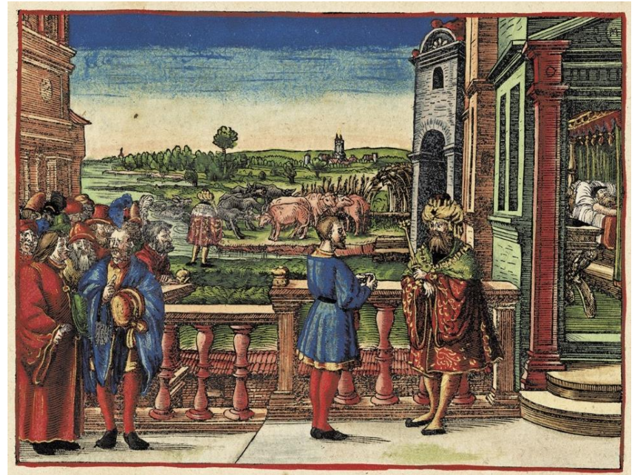
The Luther Bible 1534: Gen. 41 – Pharaoh's Dreams, p.27

ELDoNA—is not meant to offend, but is the historic practice of the Church. It is prompted by love, both for God's Word and for God's people. It does not deny that members of other denominations may be Christians. Rather, it bows the knee to the Bible's deep concern for doctrinal truth (Rom. 16:17) and the Bible's witness that doctrinal unity (Acts 2:42) is the central issue to the common reception of the Sacrament of the Altar. Therefore, we ask GUESTS desiring to commune to speak with the pastor before the service so that he may know that you are a member of a congregation in fellowship with Trinity Lutheran Church.