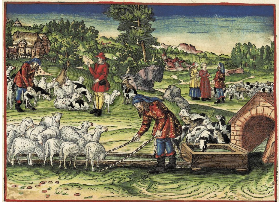
The Luther Bible 1534: Genesis 30 – Jacob works for Laban. Page 55.

Those who are not yet invited to receive the Sacrament are encouraged to meditate on God's Word in the distribution hymns and pray for the day when our divisions will have ceased.