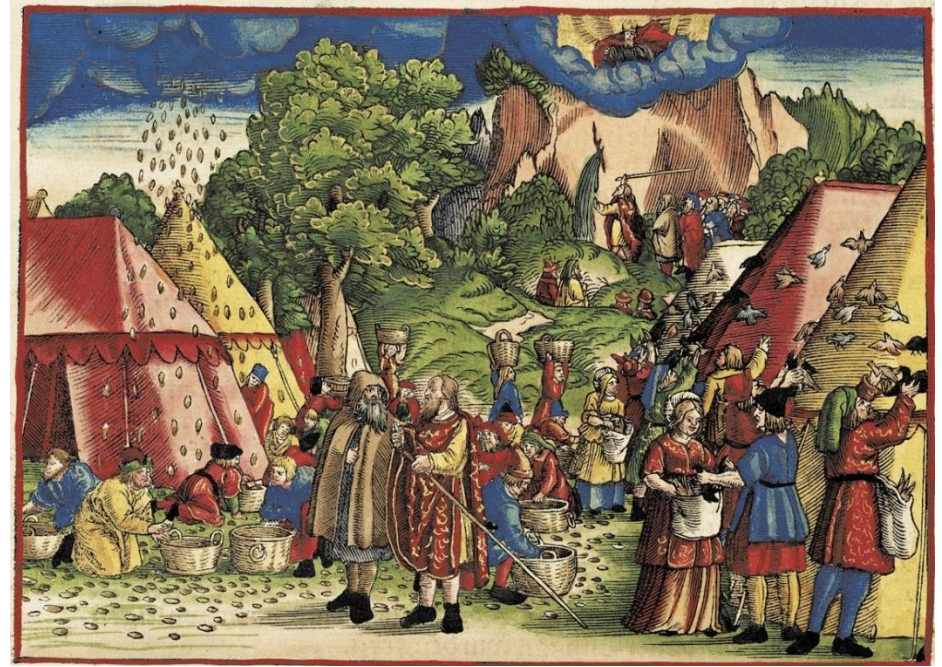
The Luther Bible 1534: Exodus 15 – Manna and Quail, p.45

All of the above will be hosted by Salem Lutheran Church (Malone, Texas). For more information, see The Lutheran Herald, Dec 2022.