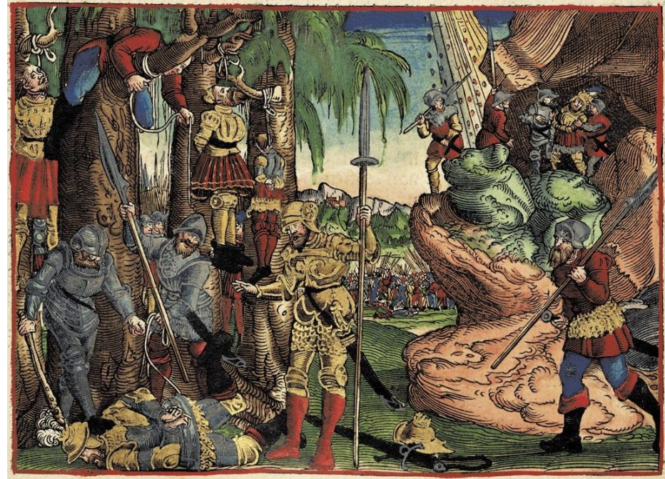
The Luther Bible 1534: Joshua 10 – The Sun Stands Still and Amorite Kings Defeated, p.7.

Those who are not yet invited to receive the Sacrament are encouraged to meditate on God's Word in the distribution hymns and pray for the day when our divisions will have ceased.