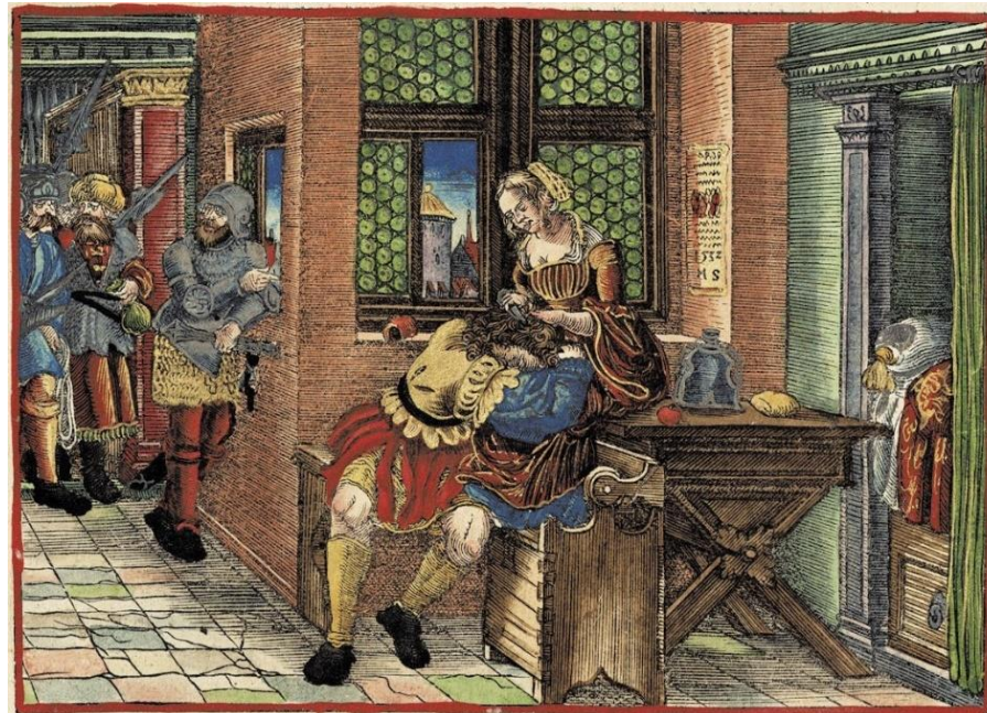
The Luther Bible 1534: Judges 16:4-22 – Delilah Cuts Samson's Hair, #351

Finances. —The congregation ended 2022 with a general operating loss of $12,163. Simply put, due to the rising costs of inflation, we could use about 5% more income over last year. If the Lord has blessed you so that you are able to help, please consider it. End-of-year reports are on the narthex rack.