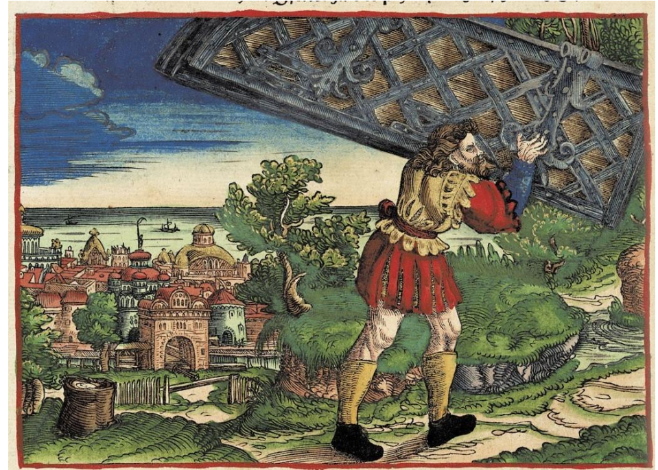
The Luther Bible 1534: Judges 16:1-3 – Samson with The Gates of Gaza, #350

Those who are not yet invited to receive the Sacrament are encouraged to meditate on God's Word in the distribution hymns and pray for the day when our divisions will have ceased.