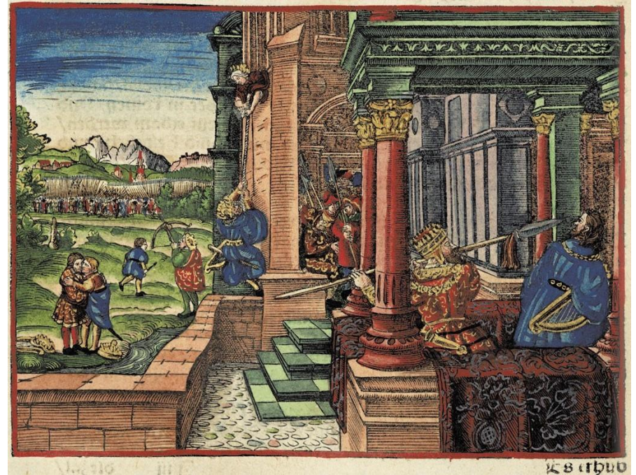
The Luther Bible 1534: 1 Samuel 18:10-11 – Saul Tries to Kill David with Spear, #394

GRANT, Lord, that we may love righteousness and hate iniquity, so that, advancing by Thee the Way, to Thee the End, we may be led by Thy wonderful right hand to the kingdom of eternal beauty; who livest and reignest with the Father and the Holy Ghost, ever one God, world without end. Amen (Oremus, 1925, p.39).