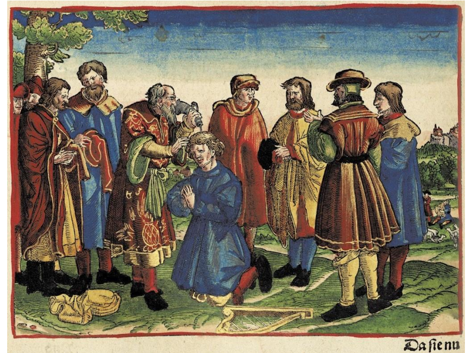
The Luther Bible 1534: 1 Samuel 16 – Samuel Anoints David, #388

Those who are not yet invited to receive the Sacrament are encouraged to meditate on God's Word in the distribution hymns and pray for the day when our divisions will have ceased.