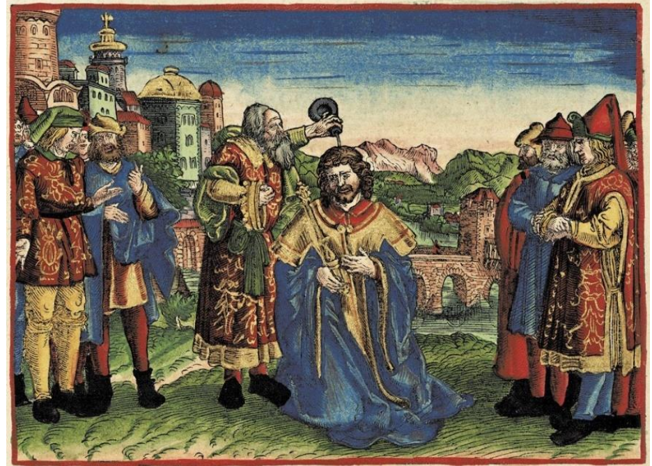
The Luther Bible 1534:

Those who are not yet invited to receive the Sacrament are encouraged to meditate on God's Word in the distribution hymns and pray for the day when our divisions will have ceased.