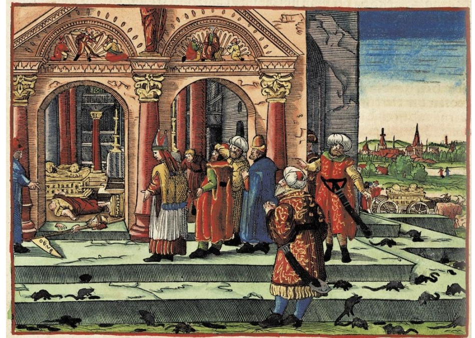
The Luther Bible 1534: 1 Samuel 5-6 Dagon's Temple, #372