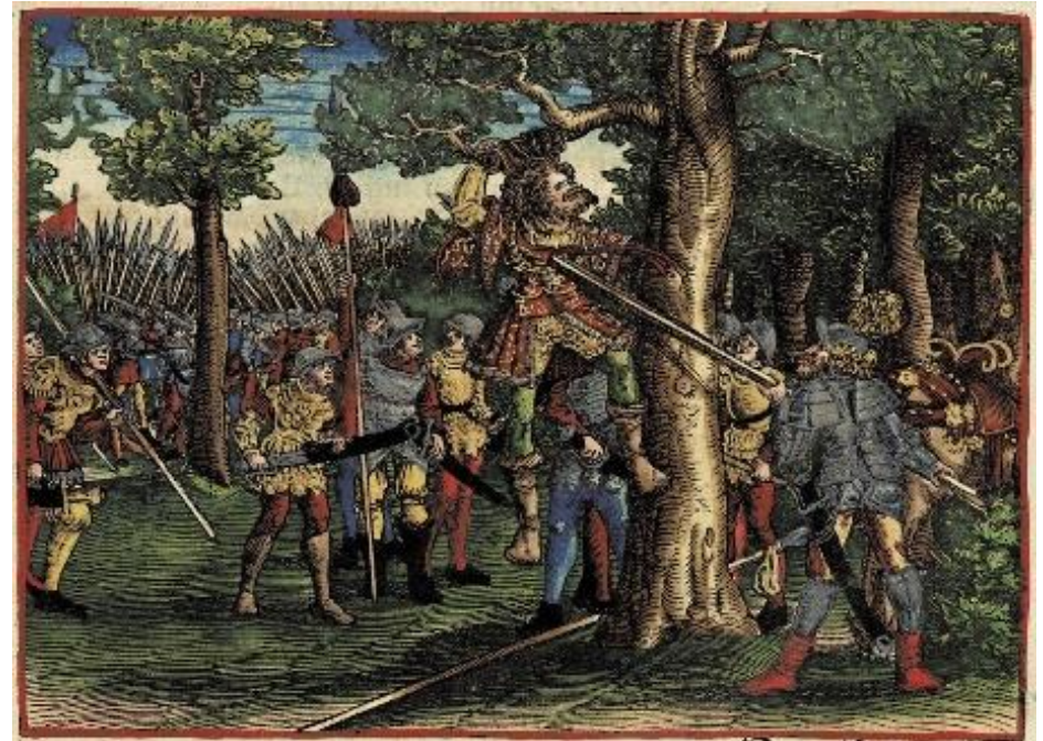
The Luther Bible 1534: 2 Samuel 18 – Absalom, #437