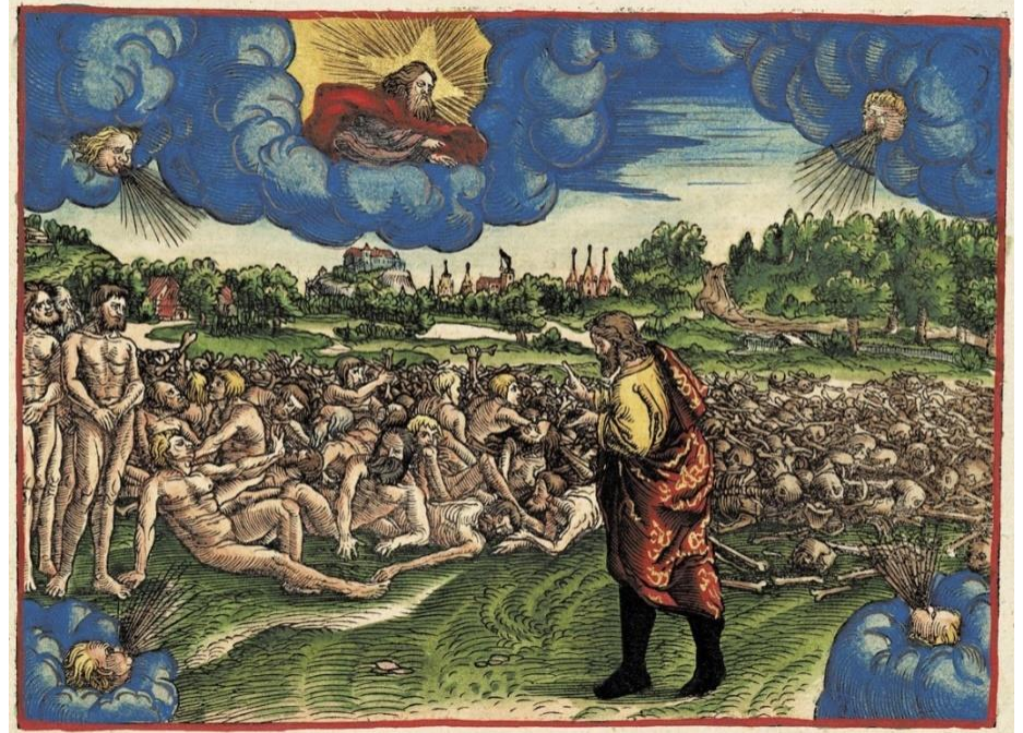
The Luther Bible 1534: (Volume 2) Ezekiel 37 – The Dry Bones, #0219

To Jesus, the Life of our flesh, Who quickeneth Whom He willeth: To Jesus, the Life of our soul, Who came that we might live more abundantly: To Jesus, the Life of His Church, Who loved her and gave Himself for her: Let all in earth, and in Paradise, reconciled by His death, and saved by His life, give glory and honor, worship and praise, now and for evermore. Amen. (Oremus, 1925, p.22).