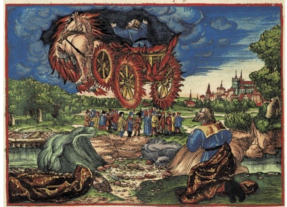
The Luther Bible 1534: 1 Kings 18 – Elijah's Chariot, #498