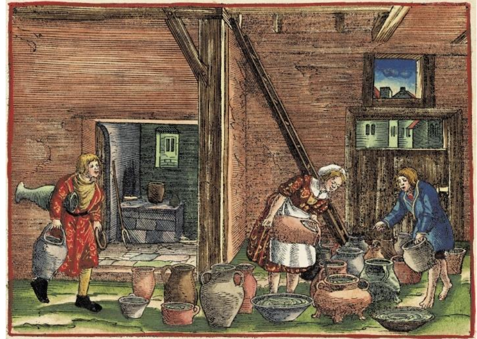
The Luther Bible 1534: 2 Kings 4 – Filling the Pots with Oil, #502

The Basics of Lutheran Teachings. — continues on Sunday, May 21 from 12:30-1:30 PM with Class #5. The next few classes will be June 4 and June 18.