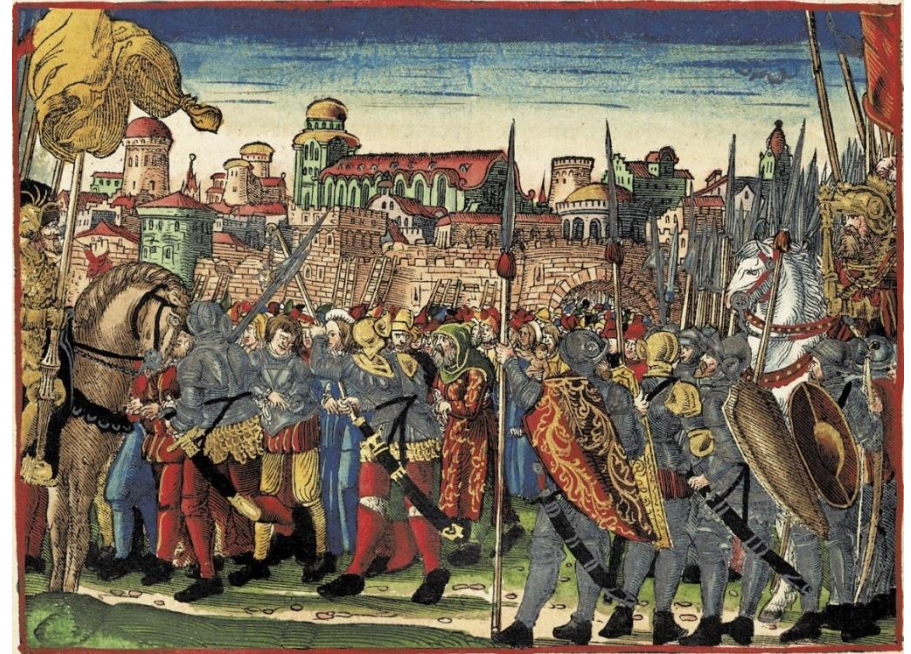
The Luther Bible 1534: 2 Kings 17 – Assyrian Exile, #526