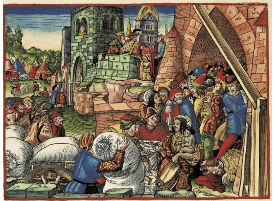
The Luther Bible 1534: 2 Kings 7 – Syrians Flee2, #508