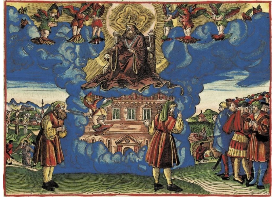
The Luther Bible 1534: Isaiah 1 –Isaiah's Vision – Isaiah 1, #0013

ELDoNA—is not meant to offend, but is the historic practice of the Church. It is prompted by love, both for God's Word and for God's people. It does not deny that members of other denominations may be Christians. Rather, it bows the knee to the Bible's deep concern for doctrinal truth (Rom. 16:17) and the Bible's witness that doctrinal unity (Acts 2:42) is the central issue to the common reception of the Sacrament of the Altar. Therefore, we ask GUESTS desiring to commune to speak with the pastor before the service so that he may know that you are a member of a congregation in fellowship with Trinity Lutheran Church.