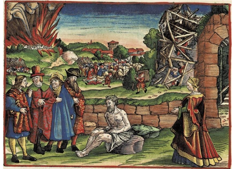
The Luther Bible 1534: Job 1 – Job's Friends Visit, #676

ELDoNA—is not meant to offend, but is the historic practice of the Church. It is prompted by love, both for God's Word and for God's people. It does not deny that members of other denominations may be Christians. Rather, it bows the knee to the Bible's deep concern for doctrinal truth (Rom. 16:17) and the Bible's witness that doctrinal unity (Acts 2:42) is the central issue to the common reception of the Sacrament of the Altar. Therefore, we ask GUESTS desiring to commune to speak with the pastor before the service so that he may know that you are a member of a congregation in fellowship with Trinity Lutheran Church.