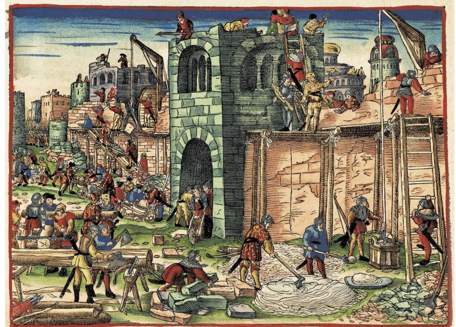
The Luther Bible 1534: Ezra 4 – Rebuilding the Temple, #644

ELDoNA—is not meant to offend, but is the historic practice of the Church. It is prompted by love, both for God's Word and for God's people. It does not deny that members of other denominations may be Christians. Rather, it bows the knee to the Bible's deep concern for doctrinal truth (Rom. 16:17) and the Bible's witness that doctrinal unity (Acts 2:42) is the central issue to the common reception of the Sacrament of the Altar. Therefore, we ask GUESTS desiring to commune to speak with the pastor before the service so that he may know that you are a member of a congregation in fellowship with Trinity Lutheran Church.