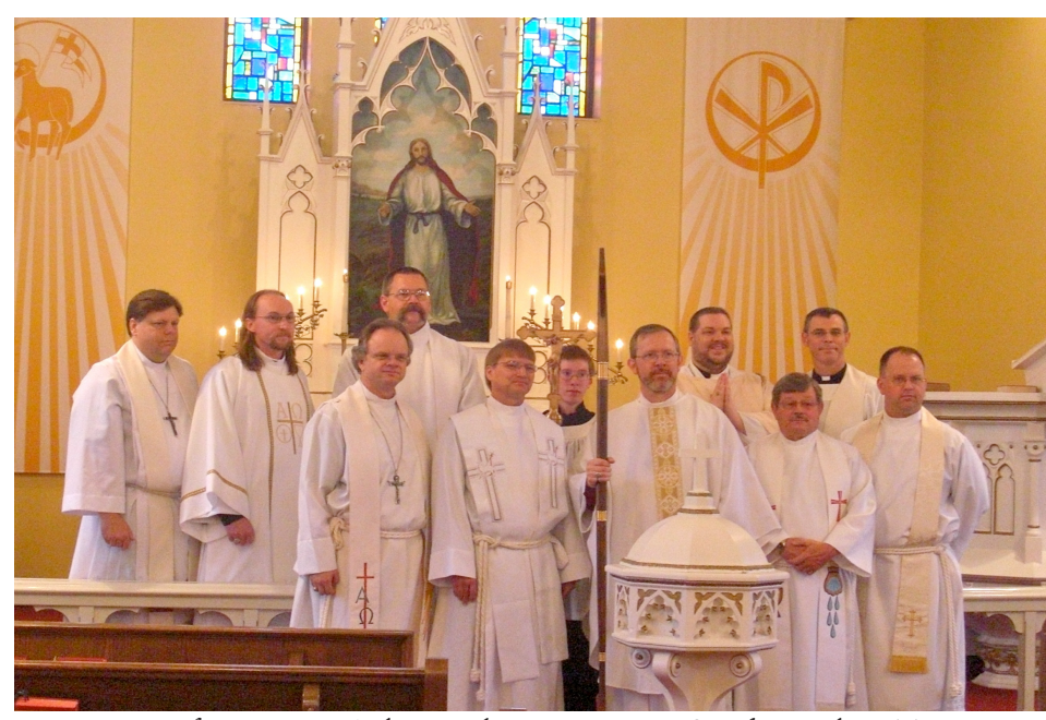
Many of our ELDoNA clergy at the 2010 Diocesan Synod in Malone, Texas.

Throughout the three years of instruction, seminarians will receive a thorough education in Greek, the study of the Scriptures, and biblical doctrine (especially as set forth in the confessional documents of the Book of Concord). Seminarians will also learn the history of the Church, and will be taught historic Lutheran practice with regard to the conduct of the Divine Service, catechesis, and other aspects of the calling of the pastoral office.