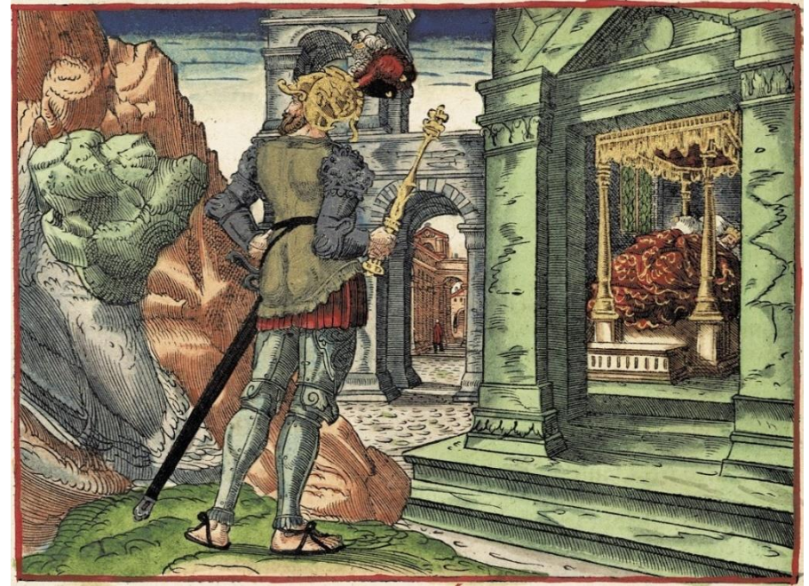
The Luther Bible 1534: Daniel 2 – Interpreting the Dream, #258

ELDoNA—is not meant to offend, but is the historic practice of the Church. It is prompted by love, both for God's Word and for God's people. It does not deny that members of other denominations may be Christians. Rather, it bows the knee to the Bible's deep concern for doctrinal truth (Rom. 16:17) and the Bible's witness that doctrinal unity (Acts 2:42) is the central issue to the common reception of the Sacrament of the Altar. Therefore, we ask GUESTS desiring to commune to speak with the pastor before the service so that he may know that you are a member of a congregation in fellowship with Trinity Lutheran Church.