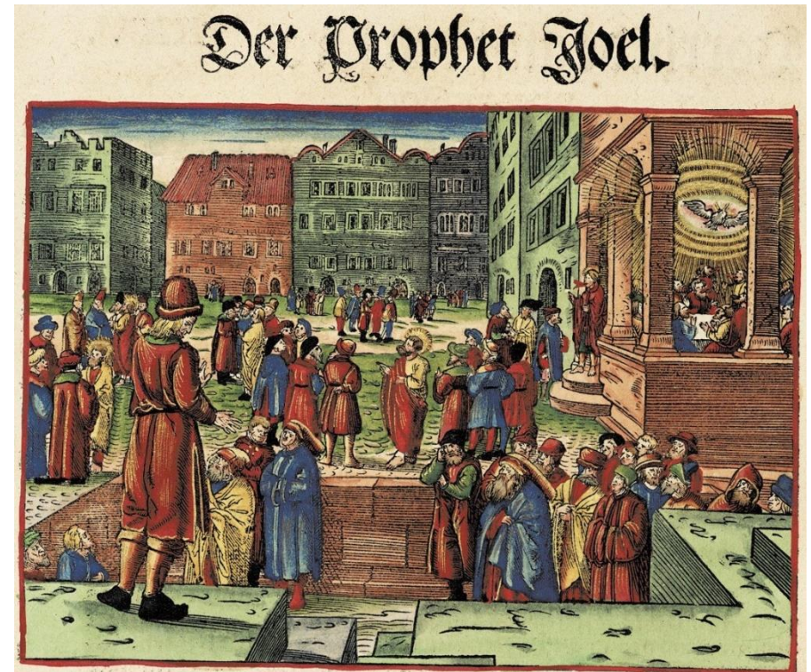
The Luther Bible 1534: Joel 1 – The Prophet Joel, #290

ELDoNA—is not meant to offend, but is the historic practice of the Church. It is prompted by love, both for God's Word and for God's people. It does not deny that members of other denominations may be Christians. Rather, it bows the knee to the Bible's deep concern for doctrinal truth (Rom. 16:17) and the Bible's witness that doctrinal unity (Acts 2:42) is the central issue to the common reception of the Sacrament of the Altar. Therefore, we ask GUESTS desiring to commune to speak with the pastor before the service so that he may know that you are a member of a congregation in fellowship with Trinity Lutheran Church.