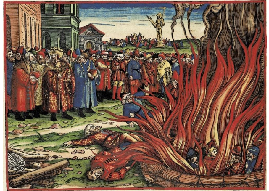
The Luther Bible 1534: Daniel 3 – The Fiery Furnace, #260

ELDoNA—is not meant to offend, but is the historic practice of the Church. It is prompted by love, both for God's Word and for God's people. It does not deny that members of other denominations may be Christians. Rather, it bows the knee to the Bible's deep concern for doctrinal truth (Rom. 16:17) and the Bible's witness that doctrinal unity (Acts 2:42) is the central issue to the common reception of the Sacrament of the Altar. Therefore, we ask GUESTS desiring to commune to speak with the pastor before the service so that he may know that you are a member of a congregation in fellowship with Trinity Lutheran Church.