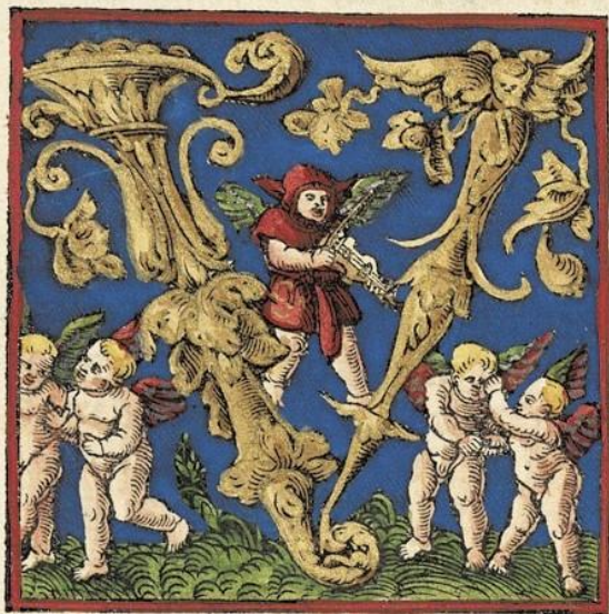
The Luther Bible 1534: The letter “V” to begin The Third Book of Moses ( Das Dritte Buch ) or Leviticus.