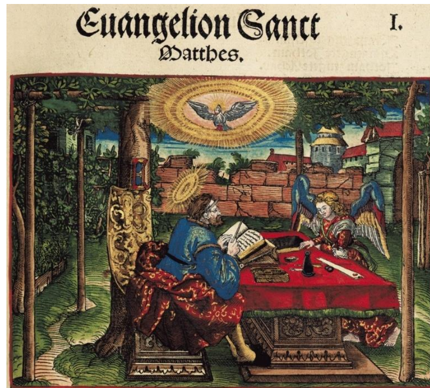
The Luther Bible 1534: The Gospel of St. Matthew, #585

c/o Anchor Memory Care Unit 1501 Sandbar Drive, Marion, IL 62959