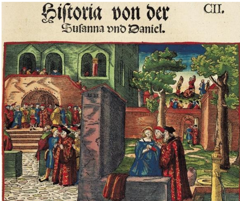
The Luther Bible 1534: History of Susanna and Daniel— Two judges hide themselves in Susanna's garden. They falsely accuse her, but Daniel finds out their malicious plot, #565

Addresses of Military and Students for Bulletins. —Please give pastor the addresses of those soldiers, which we are including in our prayers.