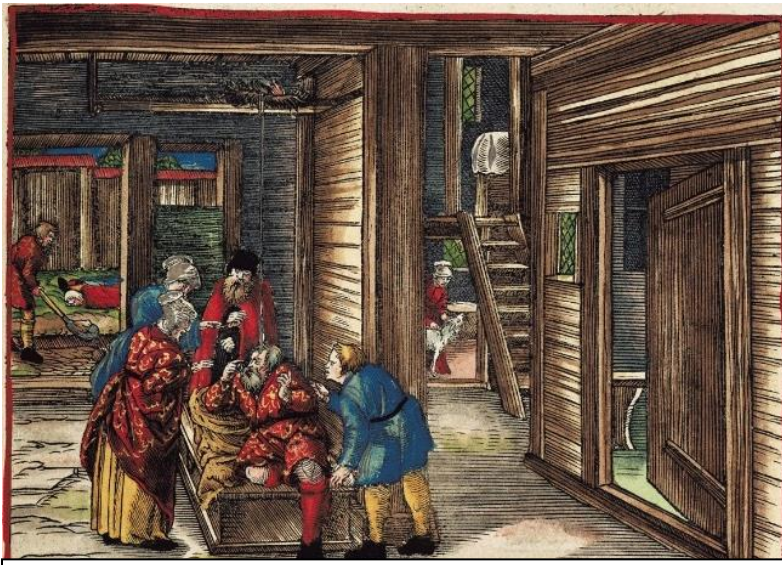
The Luther Bible 1534: Tobit ch. 2– Tobit becomes blind and is grieved by his Wife, #407

Pecans .—The annual pecan fundraiser will begin shortly.