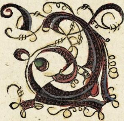
Psalm 132—Memento, Domine