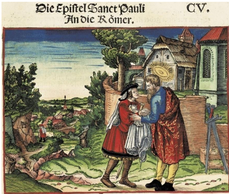
The Luther Bible 1534: The Book of Romans, #791

SUNDAY - Divine Service, Eve of the Name of Jesus 10:15 AM