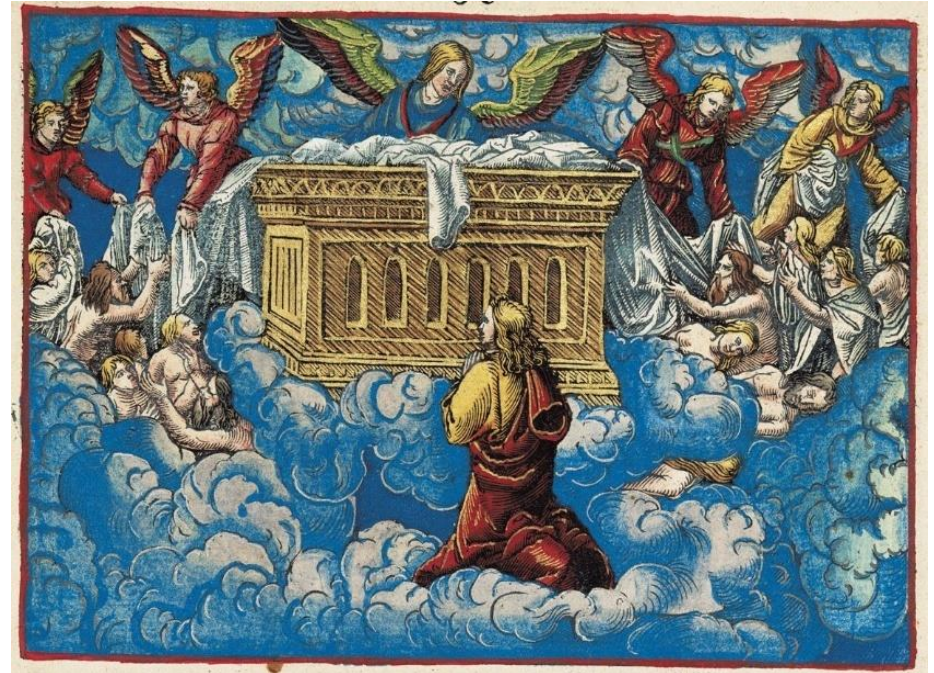
The Luther Bible 1534: Revelation 6:3-6 – The Fifth Seal with those under the Altar, #955.