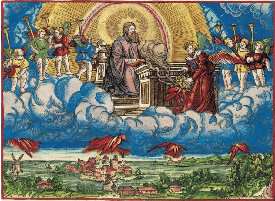
The Luther Bible 1534: Revelation 8:1-6 – The Seventh Seal with the 7 angels and the Prayers of all the Saints, #958