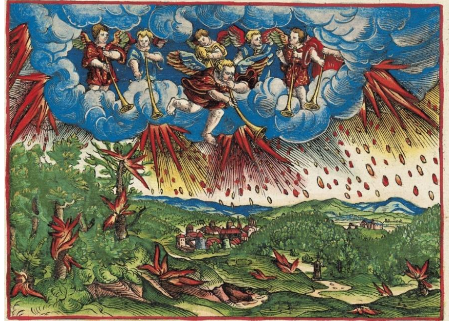
The Luther Bible 1534: Revelation 8:7 – The First Angel with Hail, Fire, and Blood, #959