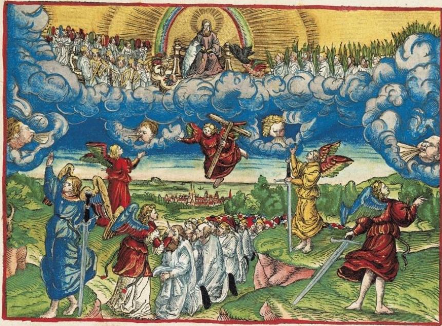
The Luther Bible 1534: Revelation 7, Sealing the servants of God on their foreheads, #957.