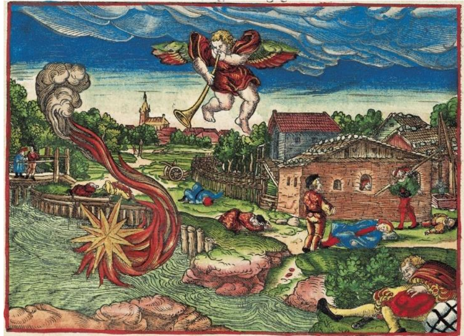
The Luther Bible 1534: Revelation 8:10-11 – The 3rd Angel with a Great Star #960b

O LORD and Lover of men, cause the pure Light of Thy divine knowledge to shine forth in our hearts, and open the eyes of our understanding, that we may comprehend the precepts of Thy Gospel; plant in us also the fear of Thy blessed commandments, that we, trampling upon all carnal lusts, may seek a heavenly citizenship, both saying and doing always such things as shall well please Thee; for Thou art the illumination of our souls and bodies, Christ our God; and to Thee we ascribe glory and honor, worship and praise, now and for evermore. Amen. (Oremus, 1925, p.137).