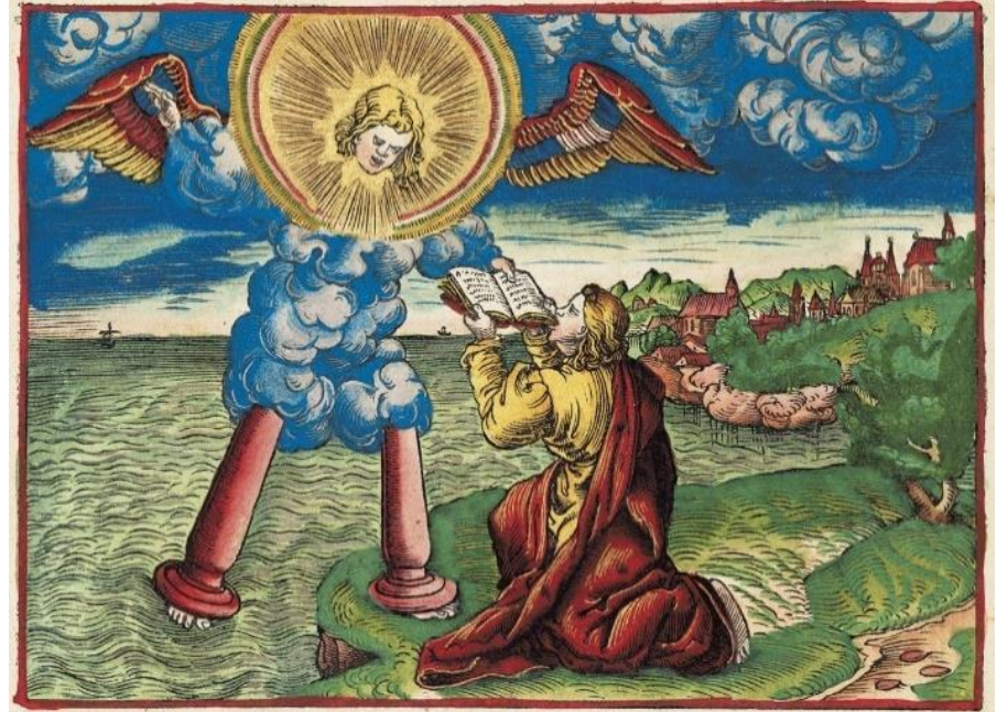
The Luther Bible 1534: Revelation 10:1-11 – The Angel and the Little Book John Ate, #964

Those who are not yet invited to receive the Sacrament are encouraged to meditate on God's Word in the distribution hymns and pray for the day when our divisions will have ceased.