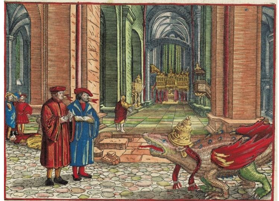
The Luther Bible 1534: Revelation 11:1-19 – The Two Witnesses and the Beast, #965

LORD, I am not worthy that Thou shouldst come under my roof, for it is desolate and ruinous, neither wilt Thou find within me place to lay Thy head; but since Thou hast not disdained to recline in a stable with the brute beasts, nor disdained to be the guest of Simon the Leper, neither hast spurned the woman, who like me, was a great sinner, nor abhorred the washing of her tears: So deign, O Lord, to receive me, the chief of sinners, to the participation of This immaculate and life-giving sacrament. Amen. (Oremus, 1925, p.142).