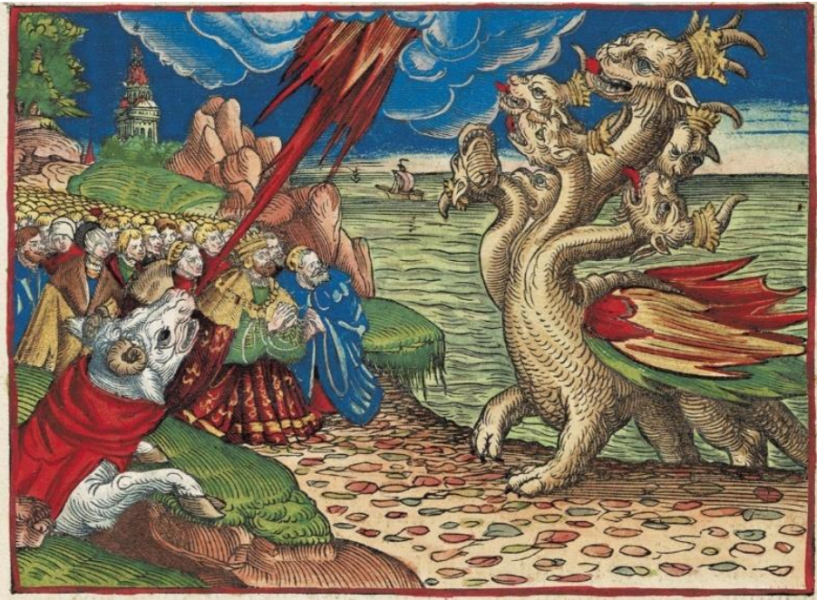
The Luther Bible 1534: Revelation 13 – The Beast from the Sea, #968