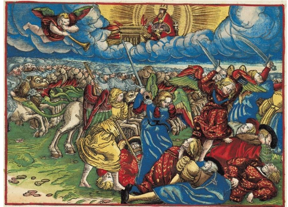
The Luther Bible 1534: Revelation 9:13-21 – The 6 th Angel with the Four Killing Angels from Euphrates, #963

Those who are not yet invited to receive the Sacrament are encouraged to meditate on God's Word in the distribution hymns and pray for the day when our divisions will have ceased.